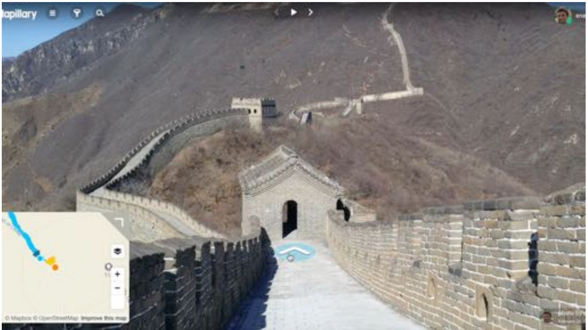
Great Wall of China (Mutianyu), yours truly